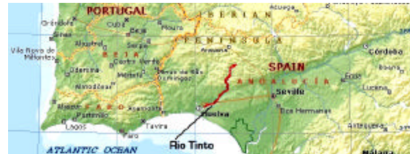
Figure 1. Rio Tinto geographic location.

Tinto and have performed exploratory drilling to search for it.