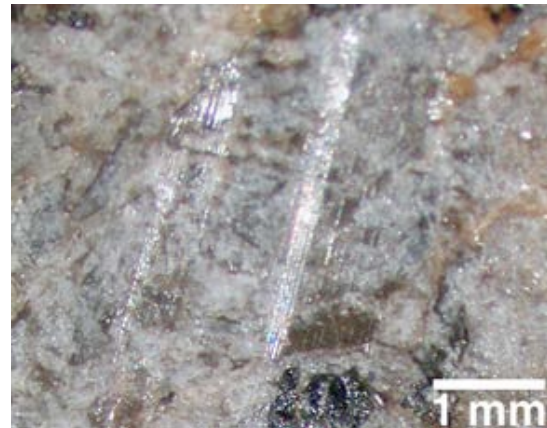
Fig. 2. As with a geologist's hand lens, MAHLI's high resolution will assist in mineral identification. For example, it can show the twinning striations characteristic of plagioclase.

the highest resolution MAHLI images can be obtained by placing the camera at a greater distance from the target; context can also be achieved from the highest resolution images of the MSL Mast Camera.