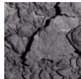
Figure 4 High resolution image of surface boulders of Itokawa (image scale being 6m). Boulder surface looks dark with brighter scratches. The surface is lack of fine regolith.