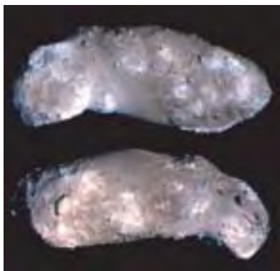
Figure 1 Composite color images of Itokawa using b-, v-, and w-band data. Top: Eastern hemisphere with the Muses Sea. Bottom: Western hemisphere where the left hand side with Yoshinodai boulder is shown in Fig. 2. The contrast adjustment was done for enhancing the color variation [3].