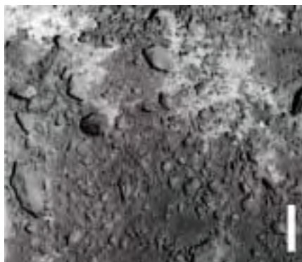
Figure 3 Close-up v-band image of the north region of the Little Woomera. Scale in the figure is 10 m.