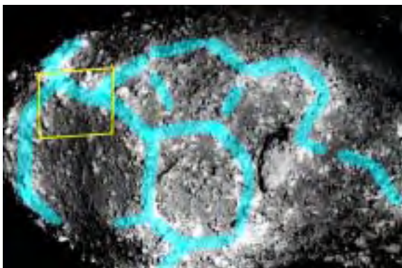
Figure 2 Little Woomera – Yoshinodai zone with faceted polygonal feature. Rims of facets (locally elevated zone denoted by light blue) are usually brighter. A rectangular box is the region of Fig. 3. The brightness contrast is enhanced in this image.