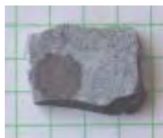
Figure 5 Artificially space-weathered sample of LL6 Benschur by nanosecond pulse laser irradiation. Darker area was irradiated by 20 mJ pulse laser scanning.