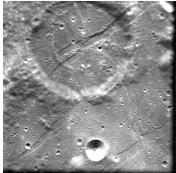
Fig.1 Crater de Gasparis: Tectonic faults due to flooding of Procellarum

resolution CCD images of selected lunar areas (Figs 1, 2) filters deposited on the CCD in white light + three filters for colour analyses, with bands at 750 nm, 900 nm and 950 nm (measuring the 1 \mu m absorption of pyroxene and olivine).