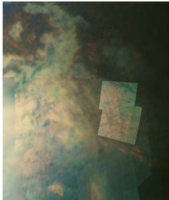
Figure 2: A blowup of Fig. 1