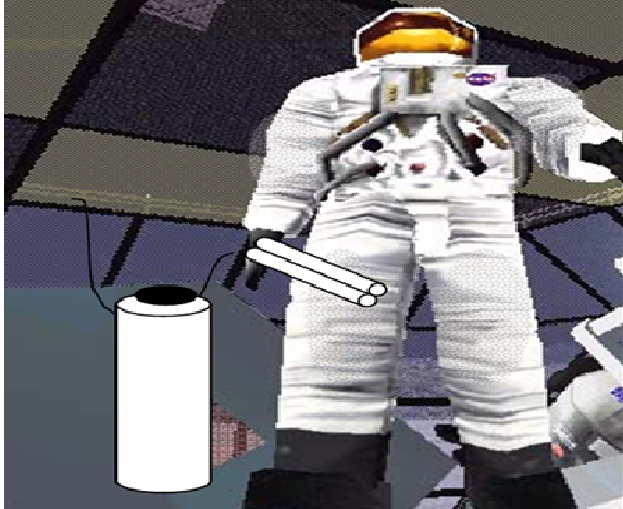
Figure 3. Components of sparkle including active double barreled gun collector and disposal container.

to attract dust with from a variety of introduced surfaces with a range of positive and negative potentials in a simulated airlock environment under a variety of temperatures and pressures, thereby establishing a proof of concept.