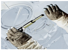
Figure 1: SPARCLE tool being used by astronaut to clean a glove in the airlock.