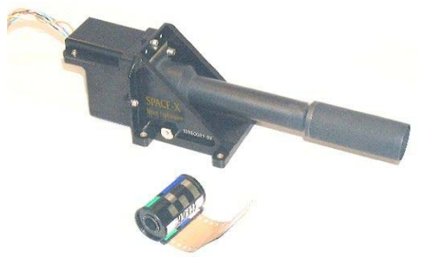
Figure 1. The AMIE camera

The Instrument: AMIE was the primary scientific camera on board SMART-1. It took images of the Moon from 15 November 2005 to 3 September 2006. During this time, it took over twenty thousand images covering a large percentage of the lunar surface. The polar coverage was especially extensive, with data taken covering a full year's worth of seasons. Previous coverage from Clementine was acquired during winter in the southern hemisphere and summer in the northern hemisphere [1]. The AMIE camera (Figure 1) includes a tele-objective with a 5.3^{\circ} x 5.3^{\circ} field of view and an imaging sensor of 1024x1024 pixels. The AMIE camera acquires images in three spectral filters, at wavelengths of 750, 915 and 960 nm; the filters are directly in front of the CCD covering an area of 11/16 of the total CCD area, with one 1/16 used by the laser filter at 847 nm, while the remaining 512 x 512 pixels (i.e., 1/4of the CCD area) are not covered by filters and thus devoted to broadband imaging.