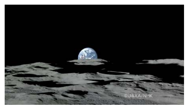
Figure 3. South pole image taken by the Kaguya space craft.

This area appears to be located on a ridge, extending radially from the Shackleton crater rim (Fig. 2). Interestingly, this sunlit area is prominent in the recently released "Earthset" image of the Kaguya mission (Figure 3) [4]. The area is a small peak about 10 km from the rim of Shackleton. Detailed study of the south pole has shown that Shackleton is located on the side of an inner ring massif of the SPA basin [5]. This small peak appears to be the summit of the massif, explaining its topographic prominence and why it receives so much sun illumination. Such a region is very important as a potential site for a future outpost on the Moon as it would have access to abundant solar energy.