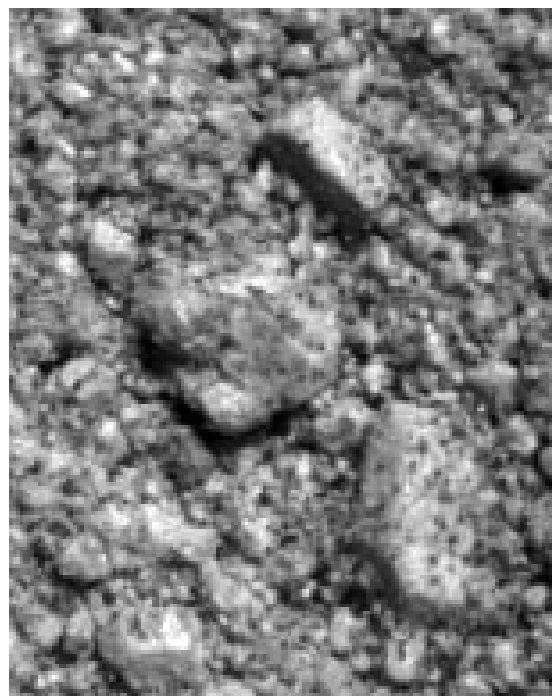
Figure 1. Part of MI image of silica-rich soil “Kenosha Comets” acquired on sol 1189. Area shown is 6 mm high, with illumination from top.

MI observations of silica-rich soils on the east side of Home Plate show evidence for dark sand grains in a fine, bright matrix (Fig. 1), suggesting precipitation from hydrothermal fluids rather than bleaching of basaltic clasts. These and other recent MI observations will be presented and discussed at the conference.