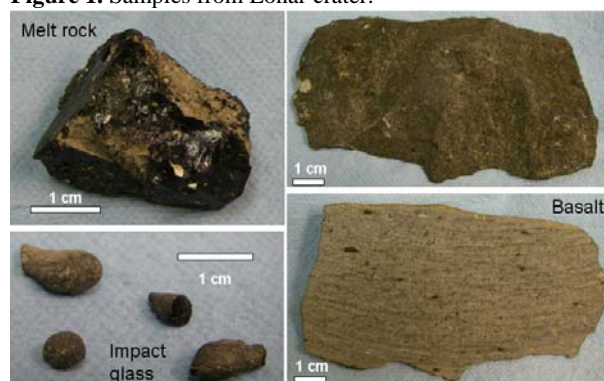
Figure 1. Samples from Lonar crater.

Results and Discussion: FTIR basalt spectra have absorptions at 1.0 and 2.0 \mu\text{m} , typical of pyroxene and glass spectra show characteristic absorption features at somewhat shorter wavelengths. FTIR spectra show minimal evidence of alteration, and imply initial impact-produced materials are extremely dry. At 3 and 6 \mu\text{m} , fundamental absorptions due to H 2 O are completely absent in the melt rock chip (Melt_fresh) and only a weak 3 \mu\text{m} feature, perhaps due to absorbed water, is present in the interior of the impact glass (Gl_int; Fig. 2). The weathered surfaces of these along with all basalt samples show significant absorptions near 3.0 and 6.0 \mu\text{m} along with subtle 1.9 \mu\text{m} bands, indicative of H 2 O and occasionally 2.3 \mu\text{m} bands indicative of Fe/Mg smectite clays.