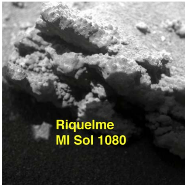
Abbildung 2. This MI image of Riquelme shows spheroidal clasts, possibly lapilli.