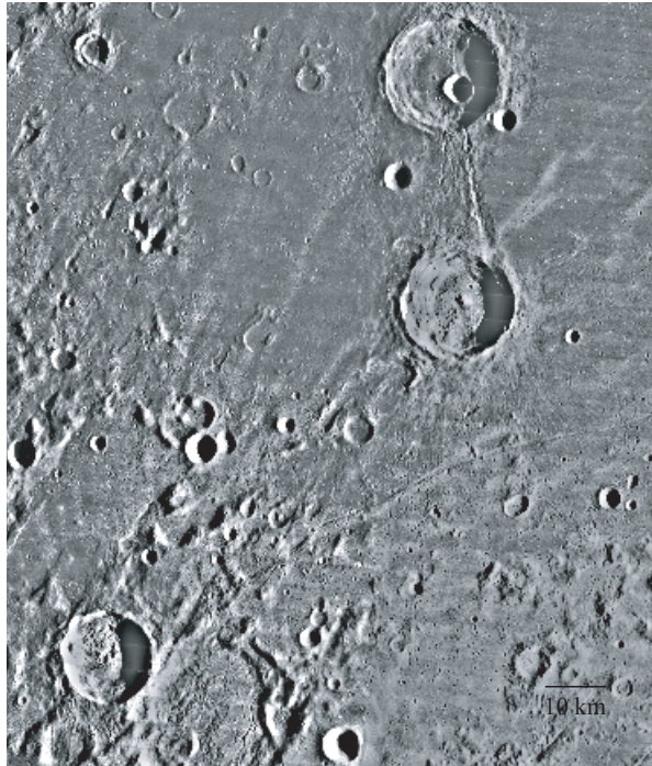
Figure 3. Lunar Orbiter image of the portion of LQ10 mapped in this study. Image covers 6.5°-17.5°N latitude and 281°-291°E longitude. North is up.

(iron-bearing volcanic glass) are likely to be important in this regard [20], and have been identified mantling the Aristarchus Plateau [21] similar deposits are found on the Marius Hills [6]. Because the surficial distribution of pyroclastics is related to their subsurface distribution, identifying and mapping pyroclastic deposits within LQ10 will provide information about the distribution of these materials through space and time.