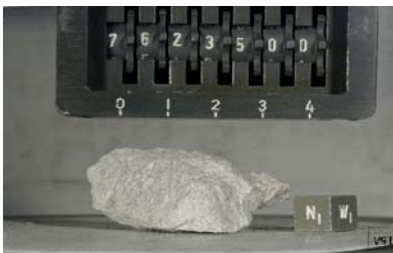
Figure 1. Photo Number S73-24016, Sample 76235.

Data Set Availability: Photographs for three Apollo missions have over 95% of photos digitized: Apollo 11, 15, and 17 [6]. The Apollo 17 Lunar Sample Data Archive is currently being compiled for PDS peer review. Additional archives will be available soon after the digitization and documentation processes are completed.