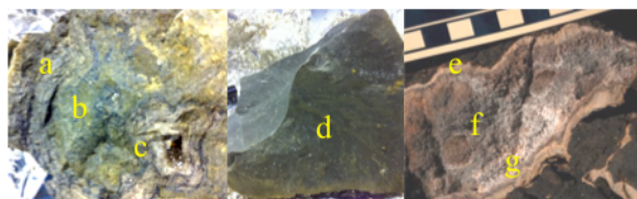
Figure 2. Left: Knorringfjell sample with a) black lithology, b) green lithology, and c) white lithology. Middle: Micrite (d) sample from Knorringfjell. Right: Sigurdfjell sample with e) external carbonate crust, f) internal carbonate, and g) carbonate/basalt interface cement.

At Knorringfjell, carbon isotopic data for the green (a) and black (b) lithologies indicate a biological