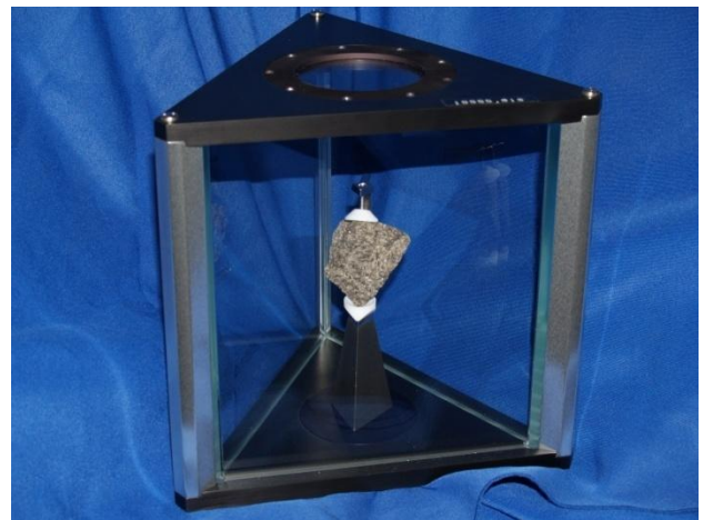
Sample displays are available for long term loan from JSC.