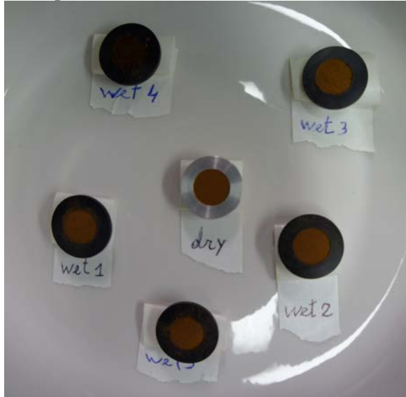
Figure 1: The cups containing JSC Mars-1 sample 25-63 \mu\text{m} grain size fraction at different level of moisturization.

Results: Figure 2 shows the reflectance spectra (from 0.45 to 1.1 \mu\text{m} ) of the six samples. The “dry” cup does not differ from the wet1 and wet2, suggesting that albedo is insensitive to small changes in the amount of moisture in the soil. In fact, a limited amount of water in the soil seems to increase, a little bit, the reflectance of the soil. Only at wet3 (20% moisture) and wet5 (30% moisture) does the reflectance of JSC Mars-1 begin to look darker with respect to dryer conditions. The “big step” in reflectance change happens at moisture values around 40% in weight.