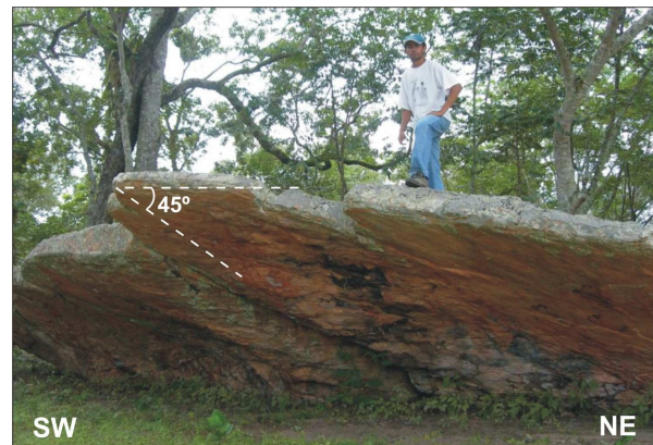
Figure 1. Field photograph of lithic sandstone tilted and located at the Riachão rim.

Acknowledgements: This research was supported by a grants from FAPESP and CNPq, Brazil. The authors express their gratitude for the palynological analysis by P. A. Souza (Inst. of Geosc., Fed. Univ. of Rio Grande do Sul).