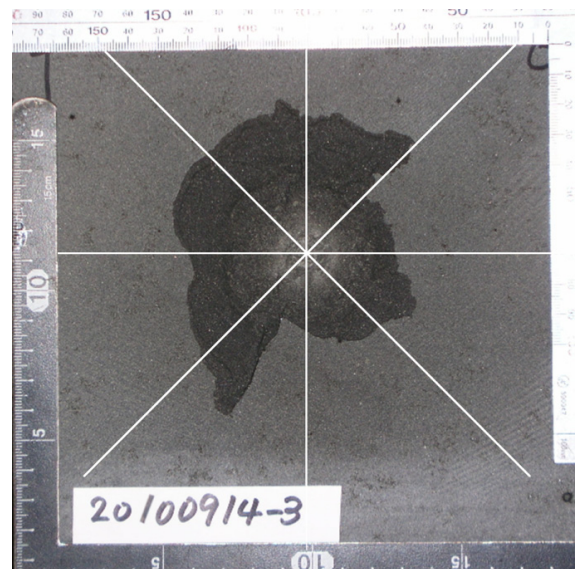
Fig 2. Method to measure the diameter.

Results: The shapes of formed craters (Fig. 1) and recovered fragments showed the large part of crater volume is excavated by the spallation. Fine particles also suggest the target near the impact point was destroyed the compression. Craters on basalt are also formed by the combination of two different mechanisms as shown by previous studies [1][2].