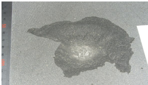
Fig 1. An example of irregular shape of formed crater.

Since the shapes of formed craters are remarkably nonsymmetrical (Fig. 1), the radius was assumed to be the average of distances from the impact point to the rim in eight directions (Fig. 2). The reason of irregular shapes may be pre-existent radial micro cracks formed when the columnar joint solidified.