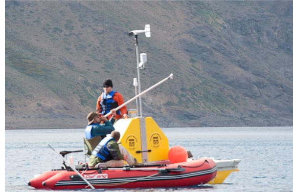
Figure 1. PLL towed to its position on Laguna Negra ( 33^{\circ}39'S/70^{\circ}07'W ) in December 2011. The lake is 6 km x 2 km large and 300 m deep. PLL carries a meteorological station and a multisensor probe to monitor the lake physical characteristics and biology for the next 3 years.

ASTEP10-0011, and by funds from the Astrobiology Education and Public Outreach program. We are also extremely grateful to the Aguas Andinas Company, Santiago (Chile) for their overall support of the project and their assistance with the logistics of our deployments.