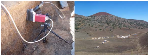
Figure 1. Field deployment of the MMI as part of the 2010 ILSO-ISRU Field Test. Left panel: MMI on tripod imaging a vertical outcrop in volcanic sediments. Right panel: ISRU base camp on the southern slopes of Mauna Kea.

MMI Instrument: The development version of the Multispectral Microscopic Imager (MMI) used in this investigation (Figure 1) captures multispectral, microscale reflectance images of geological samples at 62.5 \mu\text{m}/\text{pixel} resolution, where each pixel consists of a spectrum ranging from the visible to the short-wave infrared (463 nm to 1735 nm) [1], [2]. This spectral range enables the discrimination of a wide variety of rock-forming minerals, especially Fe-bearing phases, and enables the detection of hydrated minerals within a microtextural framework [3], [4].