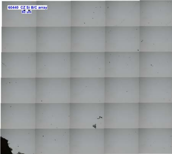
Fig. 2. Position three on sample 60440, after UPW + acid-etch.