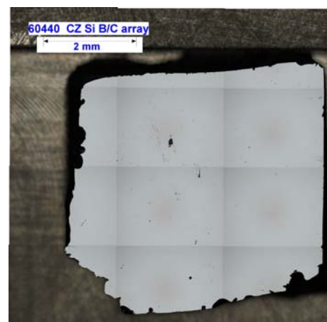
Fig. 1. Sample 60440, after UPW and acid-etch.

Sample 60440. Using comparison data for scanned areas at 50X is new for the Genesis lab. Sample 60440 (Czochnalski silicon, bulk array, Fig. 1) has been the most documented sample in this effort. The sample was cleaned with UPW at JSC, and has also been cleaned by acid etch (Caltech) and has since been returned to JSC. The sample was scanned in three areas at 50X, each about 0.8 mm 2 in area (Fig. 2). Particle distribution data has been collected for each position to illustrate the effects of UPW cleaning and the addition of acid-etch cleaning (Fig. 3). As part of the cleaning verification trail, JSC can perform this repeat imaging on the same areas on each fragment as it is returned to the facility.