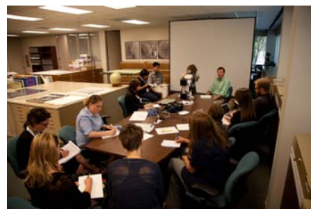
Figure 2. 2011 interns attend a weekly briefing: Microscopic Study of Apollo Thin Sections .

In addition to their research, students also interact with lunar scientists and engineers in weekly briefings – presentations about past, present, and lunar science and exploration.