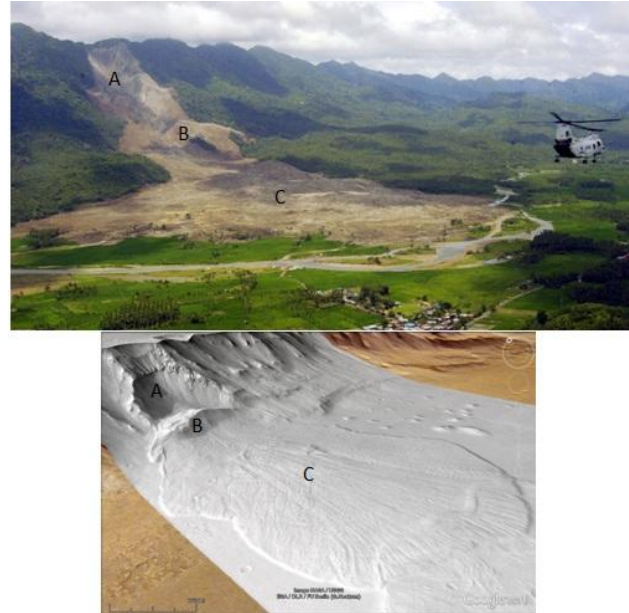
Fig. 1. Comparing the Two landslides. Top: The Guinsaungon landslide in the Philippines. Bottom: Landslide in Capri Chasma, Valles Marineris. A: Zone of Detachment, B: Zone of Erosion, C: Zone of Accumulation

The Guinsaungon Rockslide-Debris Avalanche: The Guinsaungon landslide in St. Bernard, Leyte Island originated on an approximately 800m high escarpment, a surface manifestation of the strike-slip Philippine Fault that bisects Leyte and other islands of the Philippines [6]. The failed rock mass consists of sheared and brecciated, volcanic, sedimentary, and volcanic clastics with a runout distance of 3.8 km and a volume of 15 million m 3 [5]. This destructive landslide occurred after five days continuous heavy rain and followed by a 4.3 magnitude earthquake [6]. The ease of the flow was enhanced by rice paddy fields in the valley [5,6].