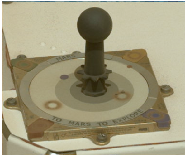
Figure 2: The Mastcam caltarget imaged on sol 72 of Curiosity's mission through the Mastcams L0 filter. The caltarget base is a square 8 cm on a side. Image ID: 0072ML055600000E1.

ment on the Mars Exploration Rovers[10] and sweep magnets were later integrated into the Surface Stereo Imager caltarget for the Phoenix mission[11].