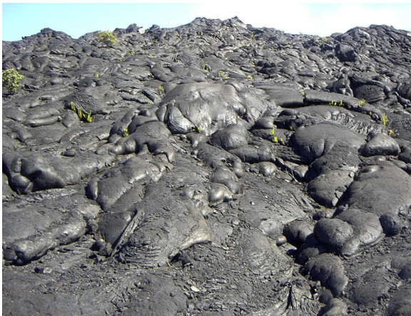
Figure 1. Typical pahoehoe flow field.

Introduction: Pahoehoe lavas are recognized as an important landform on Earth, Mars and Io [1,2]. Observations of such flows on Earth (e.g., Figure 1) indicate that the emplacement process is dominated by random effects. Existing models for lobate a`a lava flows (e.g., [3-6]) that assume viscous fluid flow on an inclined plane are not appropriate for dealing with the numerous random factors present in pahoehoe emplacement. We present a new model that incorporates a simulation approach to quantifying the influence of random and ambient factors on the evolving three-dimensional shape and morphology of pahoehoe lobes.