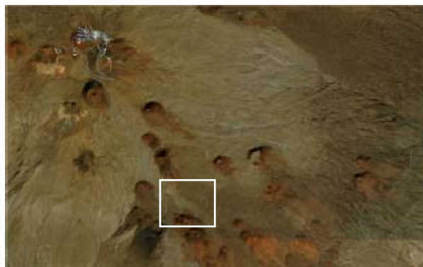
Figure 1: SE flank and summit of Mauna Kea Volcano, Hawaii; inserted box indicates the Apollo Valley and analog test region.

The rover traverse and associated science investigations were conducted over a three day period on the southeast flank of the Mauna Kea Volcano, Hawaii. The test area was at an elevation of ~11,500 feet and is known as “Apollo Valley” (Fig. 1). Here we report the integration and operation of the rover-mounted instruments, as well as the scientific investigations that were conducted.