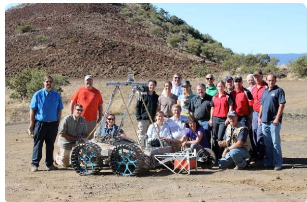
2012 MMAMA team with the JUNO II rover.

References: [1] Graham et al. (2013) submitted to the 2013 IEEE Aerospace Conference. [2] Jones et al. (2010) 15th CASI Astronautics Conference. [3] Graff et al. (2013) LPSC44.