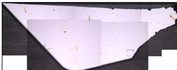
Fig. 1. Sample 60326. Features present at the time of allocation are in yellow. Features present after PI return are in red. The area bounded by the square was scanned at higher magnification (position 1).

Sample 60326: Flown sample 60326 is a silicon-on sapphire (SOS) layered fragment from the bulk-array. It is 22.7 x 9.3 mm in one dimension and has a thickness of 706 \mu\text{m} . The sample has been UPW and exposed to UV ozone cleaning at JSC. It has also had an additional surface cleaning in an HCl bath (Caltech). This sample did not have the benefit of high magnification scanning before its allocation in 2007, but its return to JSC in 2011 provided an opportunity to document the sample surface as part of this cleaning study effort. An overview scan (Fig.1) shows that small features were subsequently added to the sample surface.