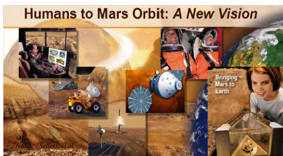
Figure 1 –An integrated plan can begin with robotic missions that lead to an orbital human mission that enables the return of samples.

There is a broad challenge in the reformulation of the Mars exploration program that truly sets the stage for: ‘a strategic collaboration between the Science Mission Directorate, the Human Exploration and Operations Mission Directorate and the Office of the Chief Technologist, for the next several decades of exploring Mars’. Any strategy that links all three challenge areas listed into a true long term strategic program necessitates discussion. NASA’s SMD and HEOMD should accept the President’s challenge and vision by developing an integrated program that will enable a human expedition to Mars orbit in 2033 with the goal of returning samples[1] suitable for addressing the question of whether life exists or ever existed on Mars