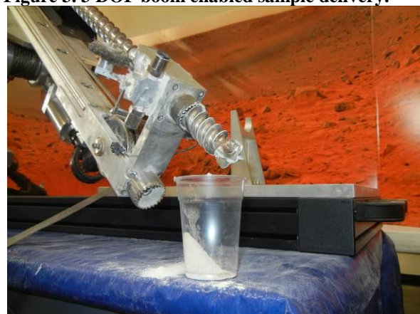
Figure 4. Sample stored within the Auger Tube and on the flutes being dropped off into a cup.

References: [1] Zacny et al., LunarVader: Development and Testing of a Lunar Drill in a Vacuum Chamber and in the Lunar Analog Site of the Antarctica. JAE ; [2] Paulsen, et al., Testing of a 1 meter Mars IceBreaker Drill in a 3.5 meter Vacuum Chamber and in an Antarctic Mars Analog Site, AIAA SPACE 2011 Conference; [3] Zacny et al., The Icebreaker: Mars Drill and Sample Delivery System, Abstract 1153, LPSC 2012; [4] Glass et al., (2011) Automated Mars Drilling for “IceBreaker”, IEEE Conference ; [5] Zacny et al.. Investigating the Efficiency of Pneumatic Transfer of JSC-1a Lunar Regolith Simulant in Vacuum and Lunar Gravity During Parabolic Flights. AIAA Space 2010.