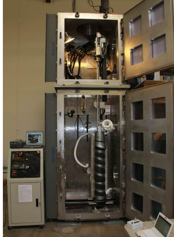
Figure 1. The IceBreaker drill in the Mars chamber.

meter in both water-ice at -20°C and water-ice with 2% perchlorate at -20°C.