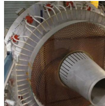
Figure 2. PIT Mk VI

The PIT is attractive as a propulsion system for several reasons. It is electrodeless, which eliminates the lifetime and contamination issues associated with electrode erosion in conventional electric thrusters. PIT operation has been demonstrated using argon, ammonia, hydrazine, helium, nitrogen, xenon, and CO 2 . Test results are shown in Fig. 3 for operation on argon, CO 2 and helium. The repetition rate of the PIT can be varied, providing constant performance per pulse (efficiency and I sp ) over a wide range of input power. The PIT has the potential to operate at high power (much greater than 50 kW) and provide thrust far in excess of 1-N. Additionally, because it is a pulsed electromagnetic thruster, PIT has a higher thrust-to-power ratio than conventional SOA Hall and ion thrusters.