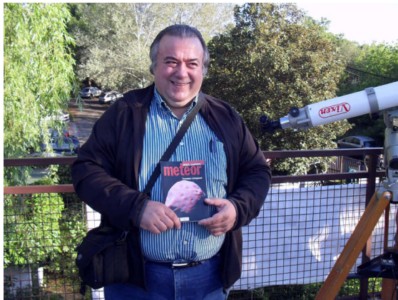
During the observation of Venus transit