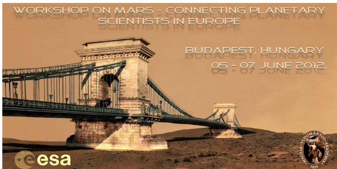
The poster of the conference: the Chain Bridge of Budapest on the Martian surface

In the summer of 2012 the first Mars related conference was organized in the East European region. The meeting was organized to help promote ESA's planetary missions (Mars Express in particular) among scientists in the region, get to know what the scientific activities of their respective communities are, and to facilitate their integration into European planetary science teams by using scientific data especially from ESA Mars missions, and also to enhance the international cooperation. The meeting was particularly addressed to scientists from countries that have recently joined ESA (Czech Republic, Romania) or have signed cooperation agreements with ESA (Estonia, Hungary, Latvia, Lithuania, Poland, Slovakia, Slovenia etc). Besides researchers, university students attended welcomed at the meeting.