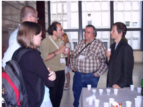
Closing discussion with Hungarian wine tasting

More information can be found at the website of the conference: http://www.konkoly.hu/MPSE