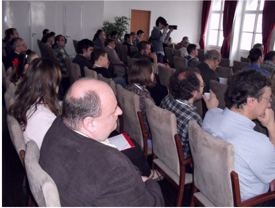
Part of the audience on the first day