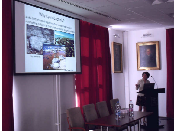
Talk on cyanobacteria and astrobiology