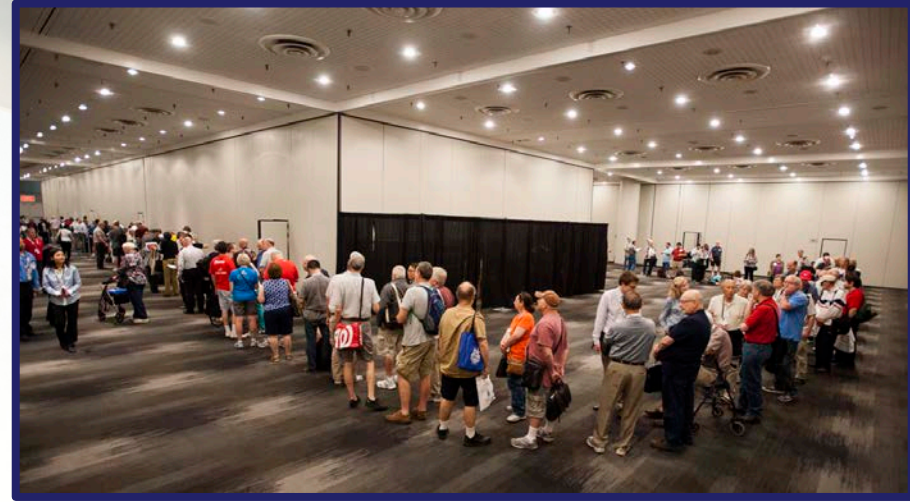
Crowds stood in line to get NASA autographs for hours the equivalent of 3 city blocks line.