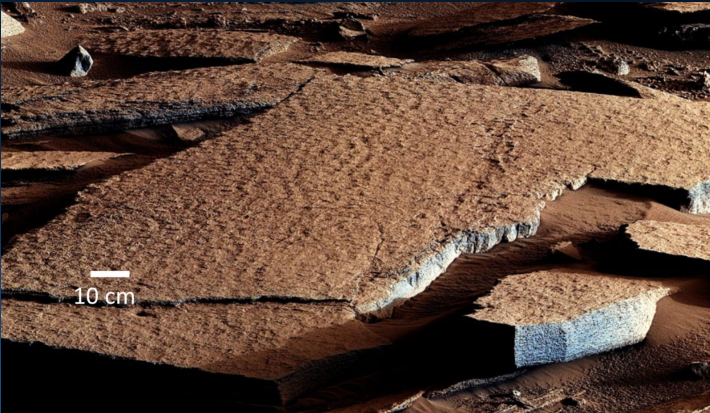
Structures on “Square Top” could have formed by wave ripples near a lake shore.

Possible wave ripples preserved in rocks examined by the Curiosity rover reveal there may have been times when an ancient lake within Gale crater was not covered by ice.