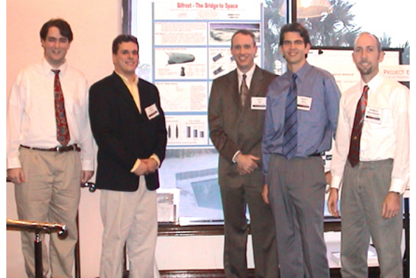
Georgia Institute of Technology "Bifrost: A Large-Scale Solution to Low-Cost Space Access"