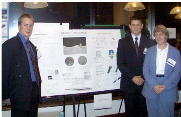
University of Maryland "The Endurance Project: Learning to Live and Work on the Moon"