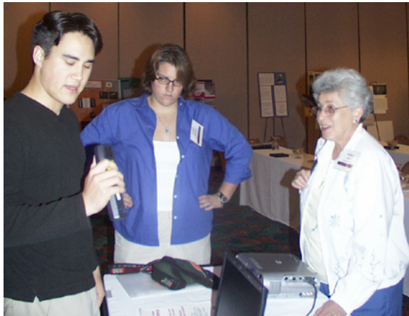
University of Washington "Self Sustained Closed Ecological Systems"