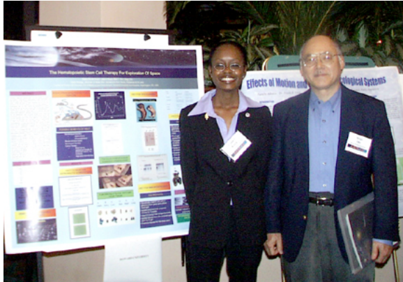
Howard University "Hematopoietic Stem Cell Therapy for Exploration of Space"