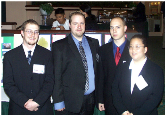
Colorado School of Mines "Martian Weather Station"