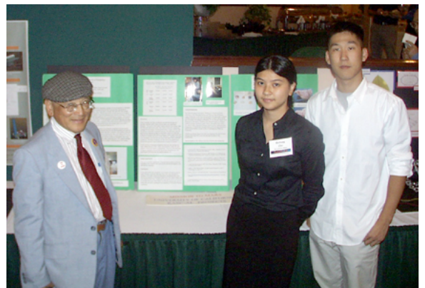
University of California, Berkeley "Exobiology: The Survival Ability of Halophiles Under Martian Conditions."