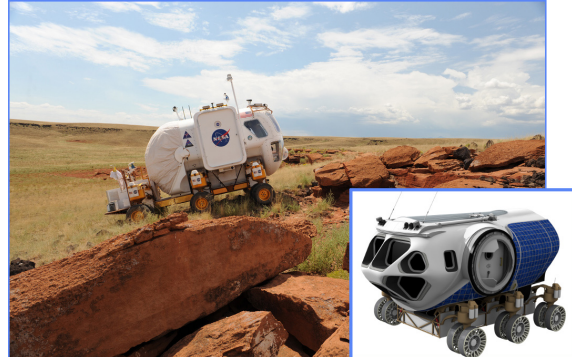
Fig. 1. A proto-type LER that has been tested extensively in simulations of 3-, 14-, and 28-day-long missions with (inset) a concept SEV.

Intravehicular activity (IVA) capabilities: Descriptions and photo-documentation of distant features are possible from within the LER during drives