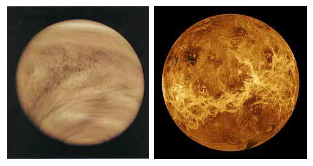
Pioneer Venus (atmosphere) and Magellan (surface) views of Venus.

The Goals, Objectives, and Investigations for Venus Exploration, also known as the VEXAG Goals Document, is a living document that is updated as needed by the Venus science community. The original document was created in 2007 and was derived from extensive community input and discussions at open meetings. Proposed revisions to the VEXAG Goals resulting from the Venus Flagship mission concept study in 2008–2009 were discussed and adopted by the VEXAG in 2009. This report represents a substantial revision to the 2009 Goals Document. The revisions, initiated at the November 2012 VEXAG meeting, included suggestions for a restructuring of the top-level Goals and reassessment of investigation priorities. The process for making revisions included an extended period where community input was solicited both online and through town hall meetings.