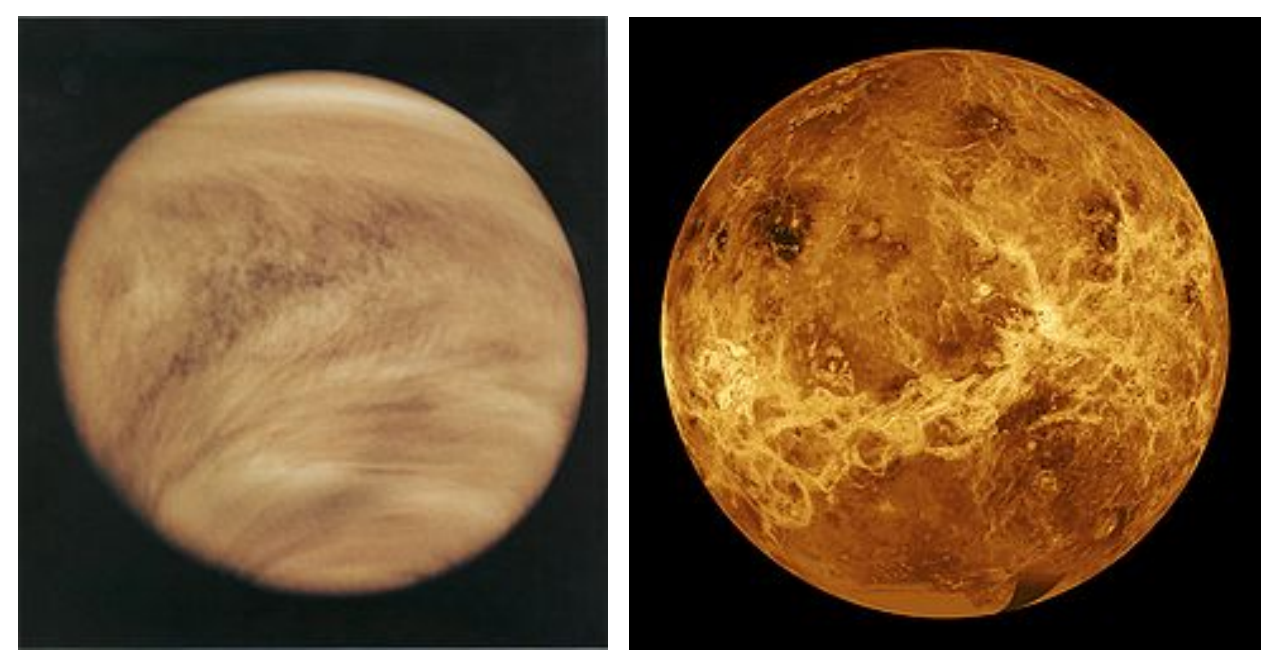
Pioneer Venus (atmosphere) and Magellan (surface) views of Venus.

The Goals, Objectives, and Investigations for Venus Exploration, also known as the VEXAG Goals Document, is a living document that is updated as needed by the Venus science community. The original document was created in 2007 and was derived from extensive community input and discussions at open meetings. Proposed revisions to the VEXAG Goals resulting from the Venus Flagship mission concept study in 2008–2009 were discussed and adopted by the VEXAG in 2009. This report represents a substantial revision to the 2009 Goals Document. The revisions, initiated at the November 2012 VEXAG meeting, included suggestions for a restructuring of the top-level Goals and reassessment of investigation priorities. The process for making revisions included an extended period where community input was solicited both online and through town hall meetings.