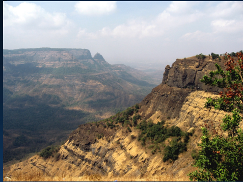
Deccan Traps LIP from Massive volcanism in Earth's past

A statistical study of the largest volcanic events in Earth's history demonstrates that similar events may have caused the heat-death of Venus and could lead to the heat-death of Earth in the future!